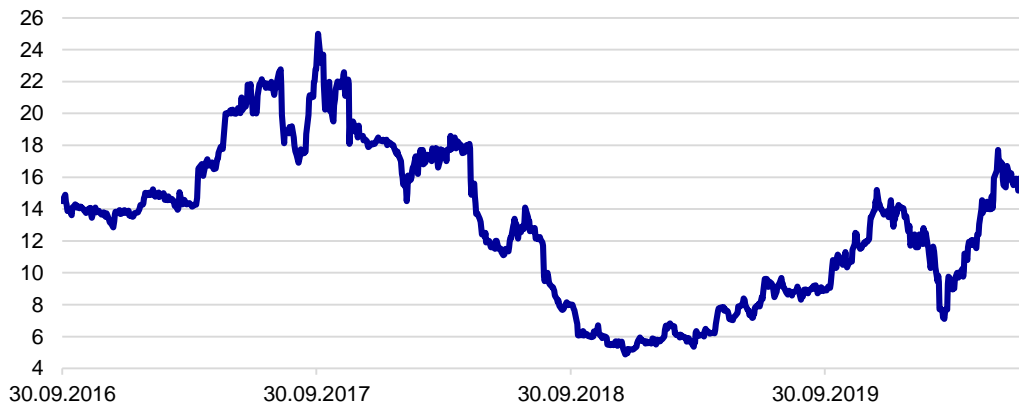
va-Q-tec (Xetra) in EUR