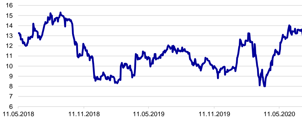
NFON (Xetra) in EUR