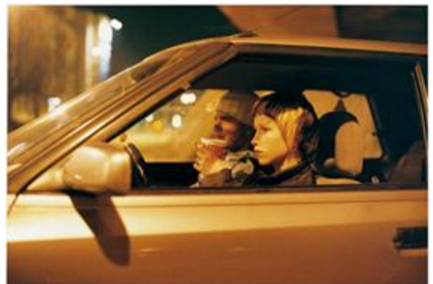
Image 16 Tobias Zielony, The opening , from the series "Tankstelle", 2007